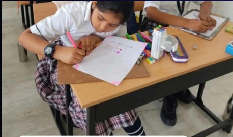
Creative writing on Father's Day - Primary students